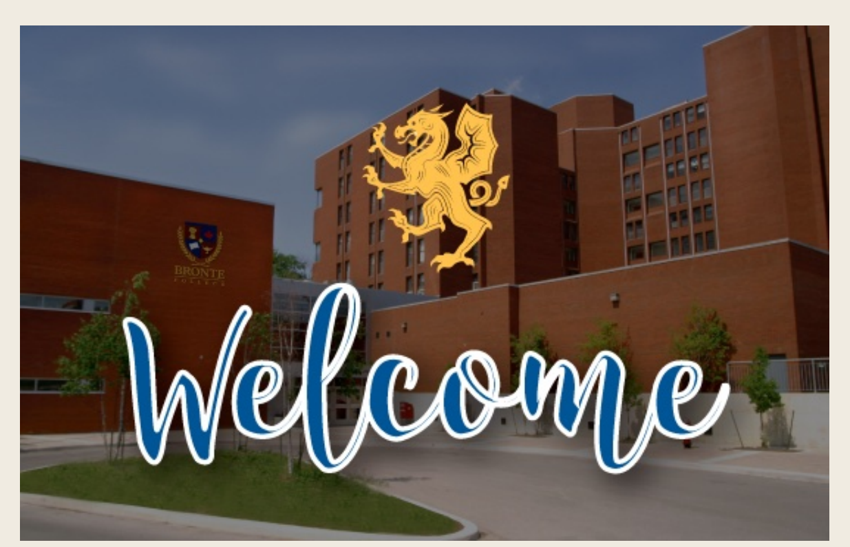
January 11, 2024

Bronte College would like to welcome everyone back to campus. We hope you had a happy, healthy, relaxing holiday and are ready to work hard on your culminating projects and activities.